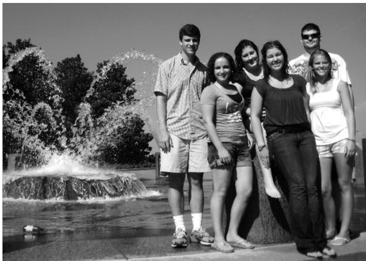
Graduated high school seniors enjoyed one last week together in Charleston. It was a great time to reflect upon the past and look forward to the future as they prepare for the next step in their lives.